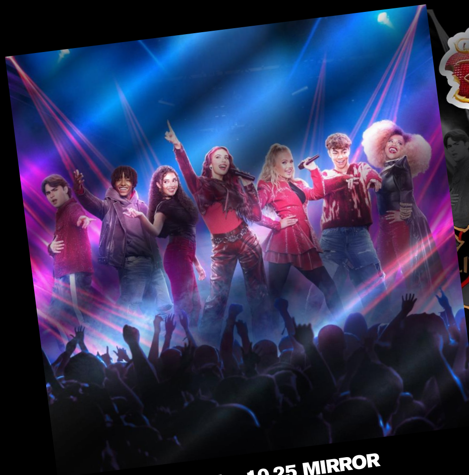
10.5 x 10.25 MIRROR FOIL COLLECTORS SLEEVE