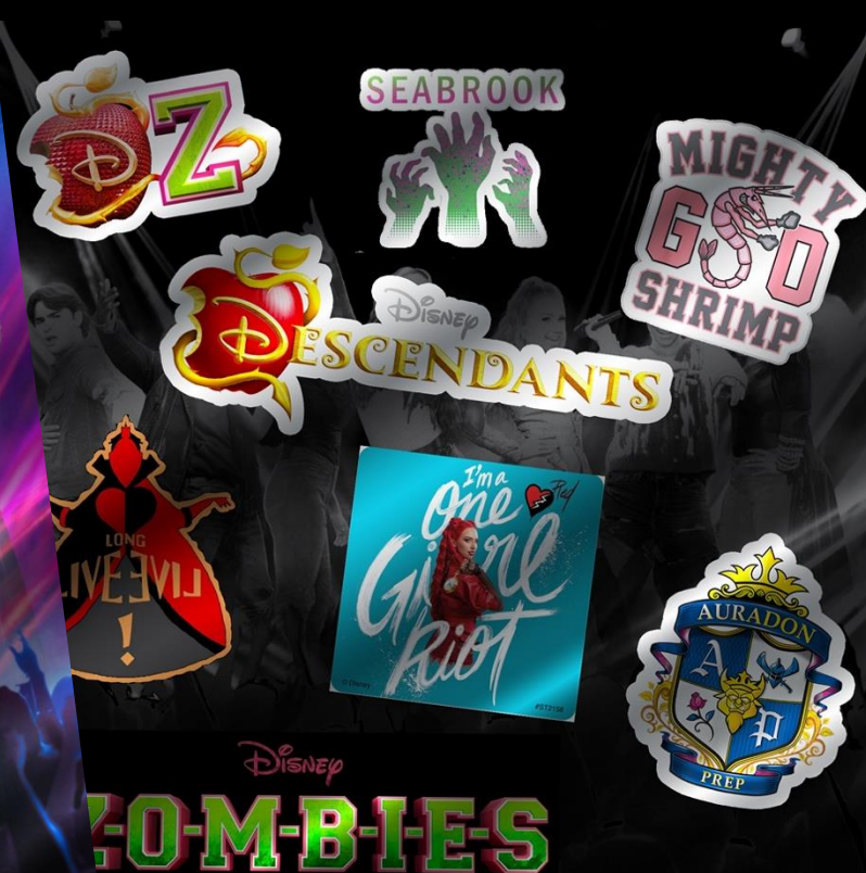
10 x 10 MIRROR FOIL STICKER SHEET