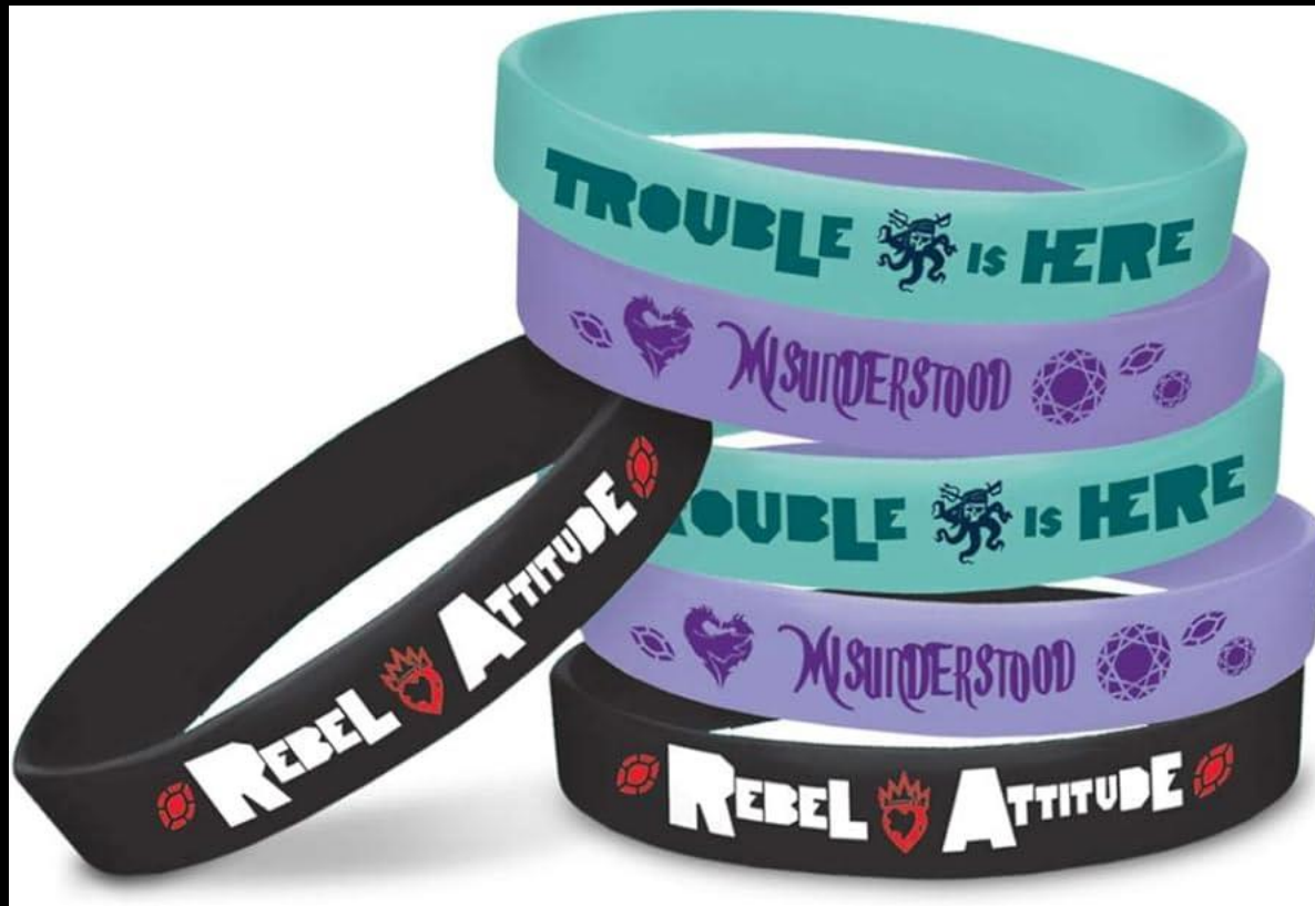
DESCENDANTS SILICONE WRISTBANDS