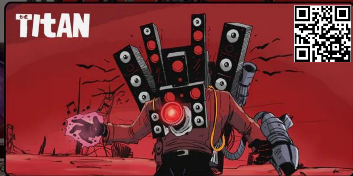
i6|4D 5 Year Vinyl Sticker – TRY IT NOW!

Our stickers can be produced in sheets, or as individual stickers.